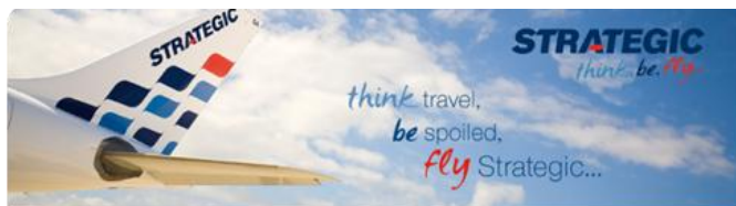
Strategic Airlines – www.flystrategic.com.au

These organisations/people kindly donated items in support of our school and parish community. Please support these fantastic businesses who have been so generous – check out their website and contact details below: