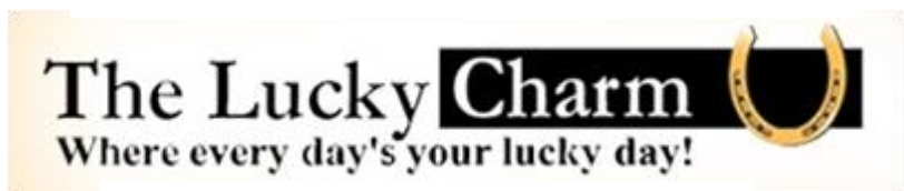
Lucky Charm Newsagent Southern River www.theluckycharm.com.au