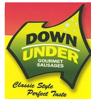
Down Under Meats Ph: 0433 496 009